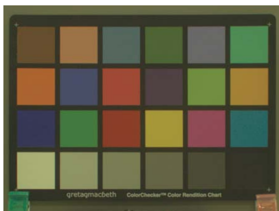
2500lx, Gain Analog 6 dB